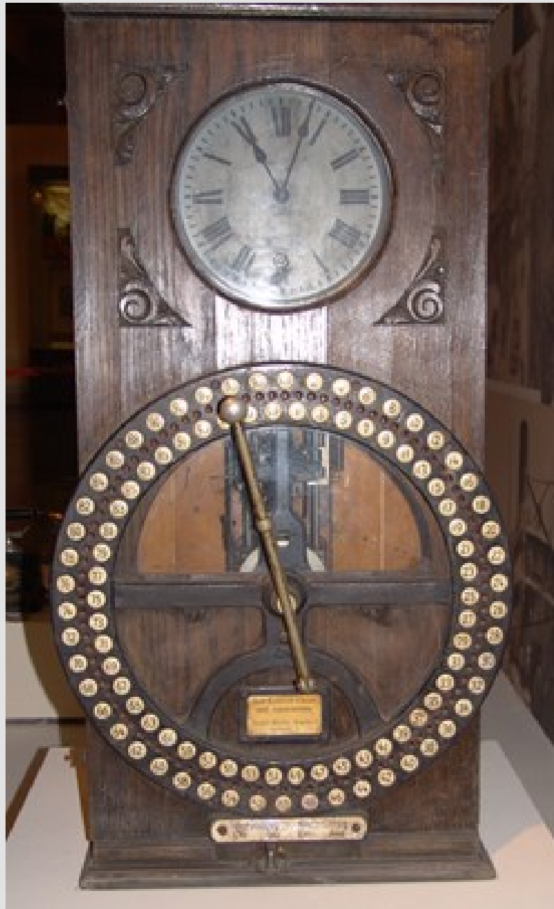
German clock counting the time and working hours in a tobacco factory in Plovdiv, early 20 th c.