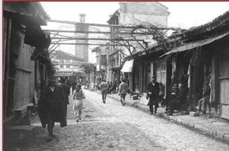
Florina's marketplace with its wooden clock tower (early 20th c.)