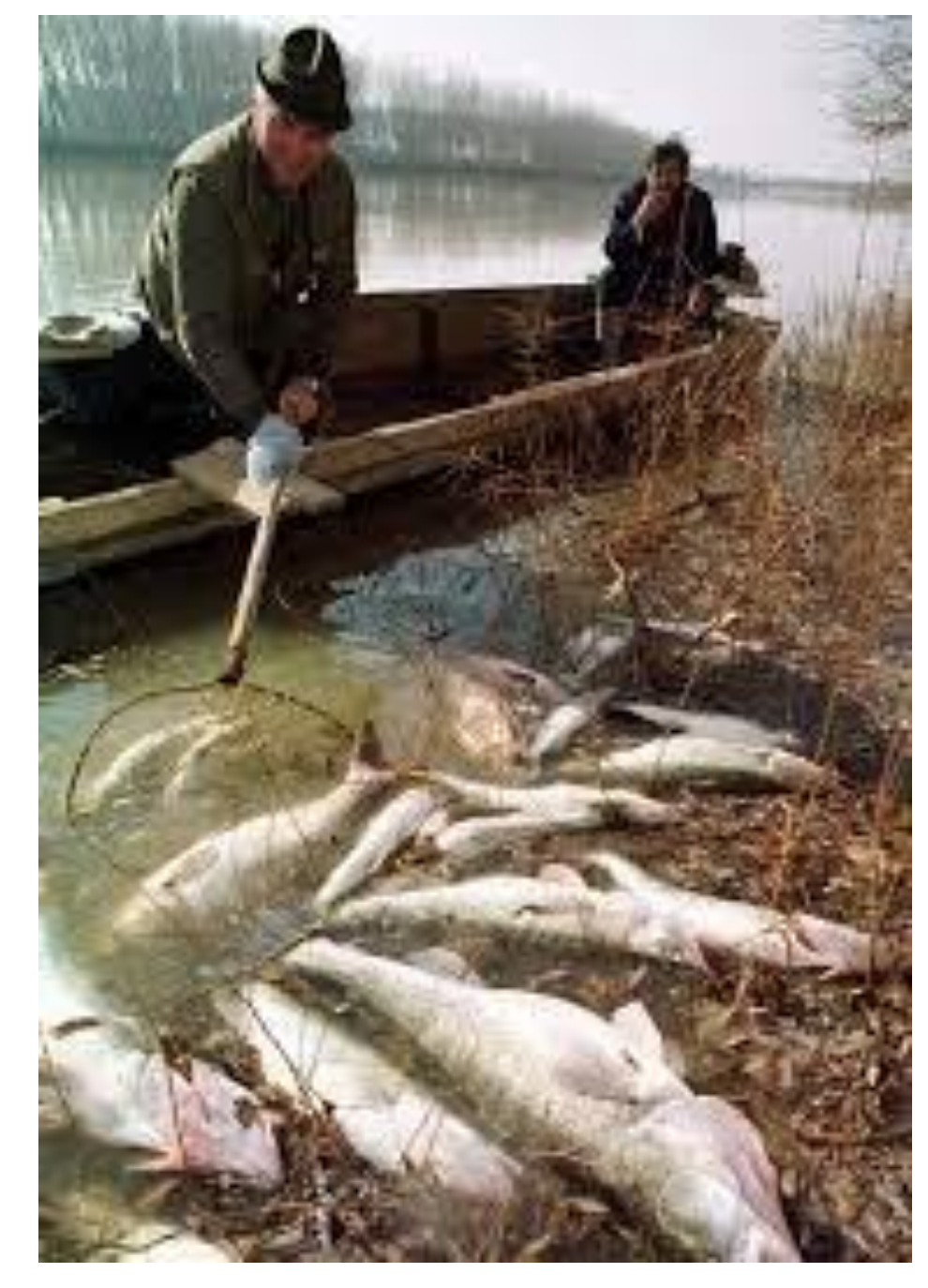
Fig. 8. (Right) After effects of the Baia Disaster (2000). The event was called in the press of the time as "The new Chernobyl".