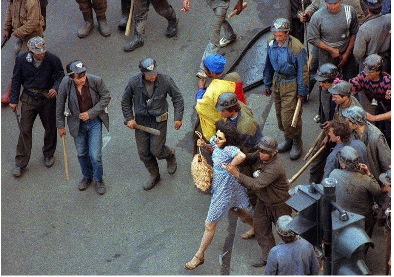
Fig. 4. A photo taken at what is today The Revolution Square, in Bucharest, December 1989