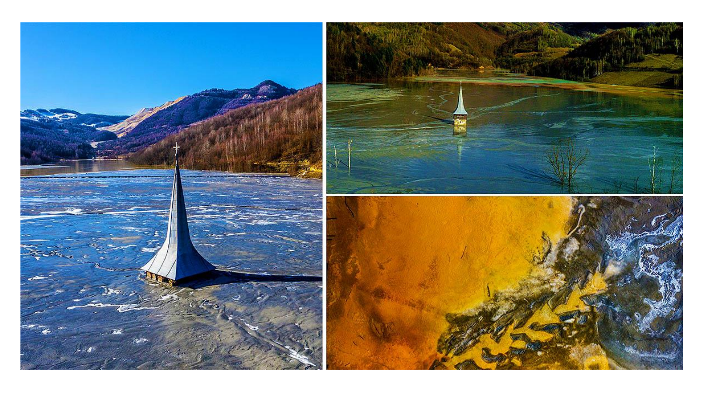
Fig. 7. (Up) Photos showing the Geamana Lake/Village, close to Rosia Montana, next to the Rosia Poieni mine. An example of controlled waste management.