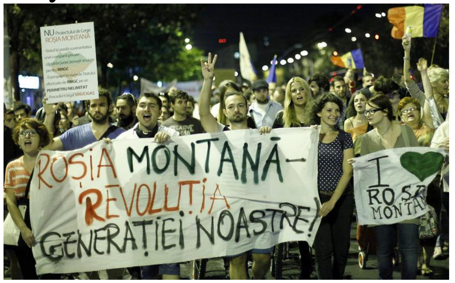
Fig. 8. A photo taken during a protest in Bucharest (2013). The main sign

states: Rosia Montana-The Revolution of our Generation