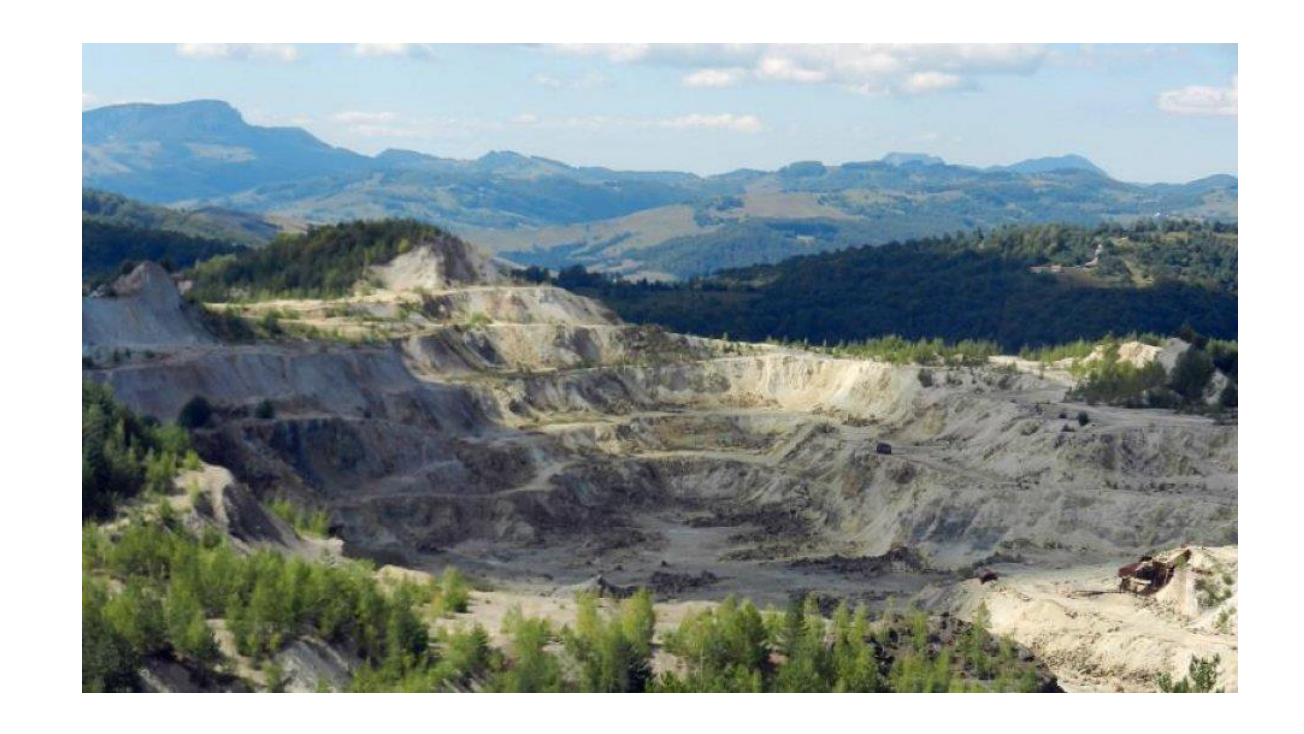
Fig. 9. The modern, open-pit mine at Cetate.